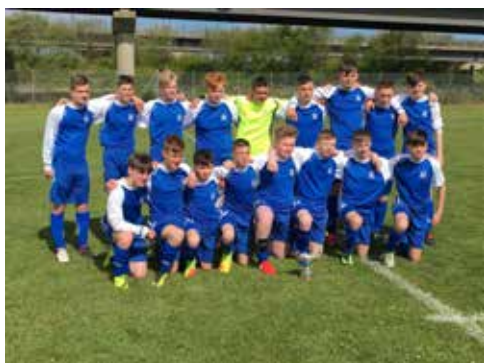
Johnstone High School Under 15 football team